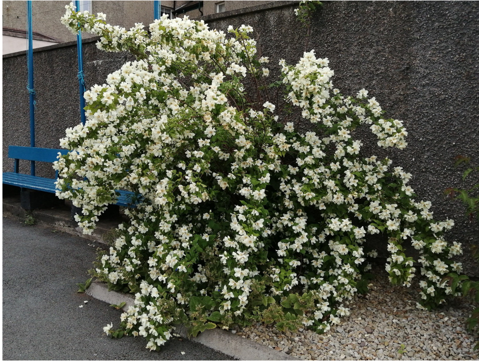
Illustration 5: The club's Philadelphus (Bride's Blossom) in full bloom.